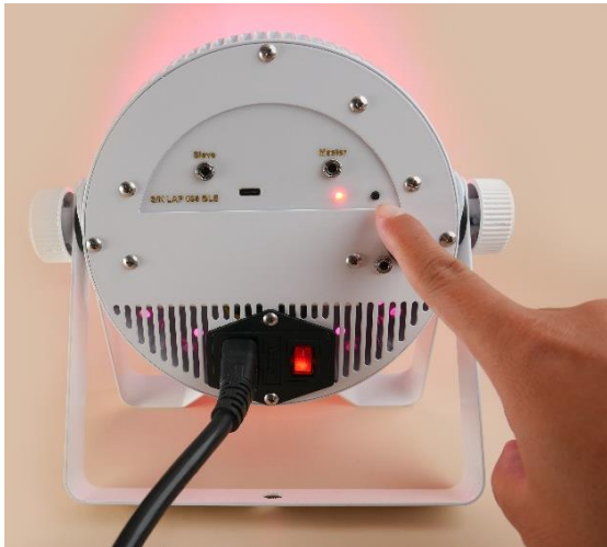
Push Switch Change mode