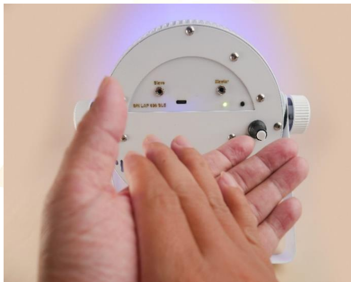
Clap your hands, Light Alchemy will flash according to your applause.