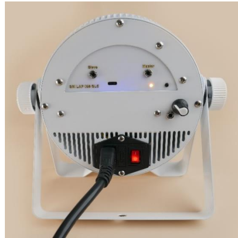
LED Status Chang to Green