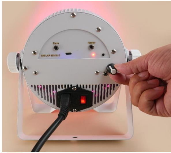
Turn the Sensitivity Knob to the right