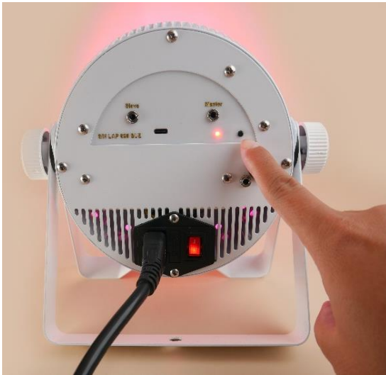
Push Switch Change mode